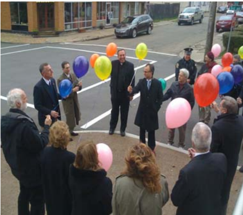
Rep. Murphy joins elected officials from Carnegie, Heidelberg and Scott Township for the Tri-Community Revitalization Project balloon launch and kick-off ceremony.

In 2008, I secured federal funding to revitalize Washington Pike, Carothers Ave., and Third Street in Heidelberg, Scott, and Carnegie. As part of the planning process, numerous meetings and site visits were conducted by municipal officials, PennDOT, and me. Just a few weeks ago, I had the opportunity to attend the 'kick-off' ceremony to mark the announcement of public bids for the revitalization project.